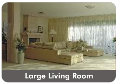
Large Living Room